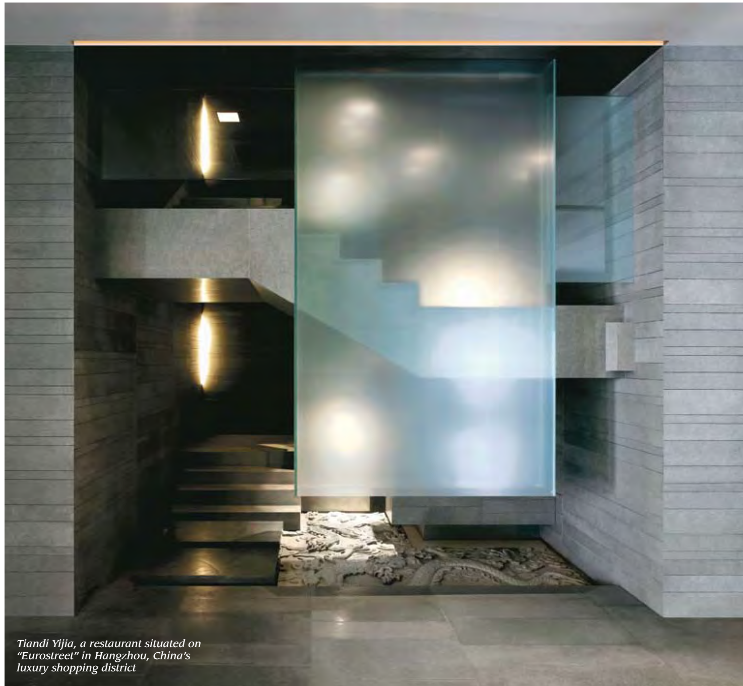
Tiandi Yijia, a restaurant situated on "Eurostreet" in Hangzhou, China's luxury shopping district

an excessively technical methodology which can kill ideas. The project's ultimate purpose becomes broader through this process. For example, the semantics of a place can generate an entire creative process, a "crucible" of ideas, in which architecture is not merely a self-serving aesthetic expression, but a creative act capable of catalysing an entire transformative process.