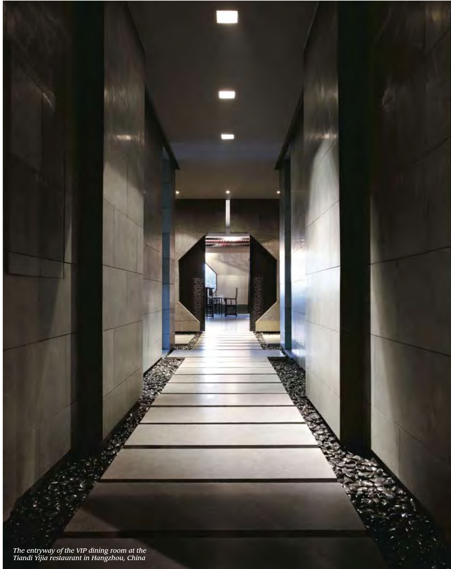
The entryway of the VIP dining room at the Tiandi Yijia restaurant in Hangzhou, China