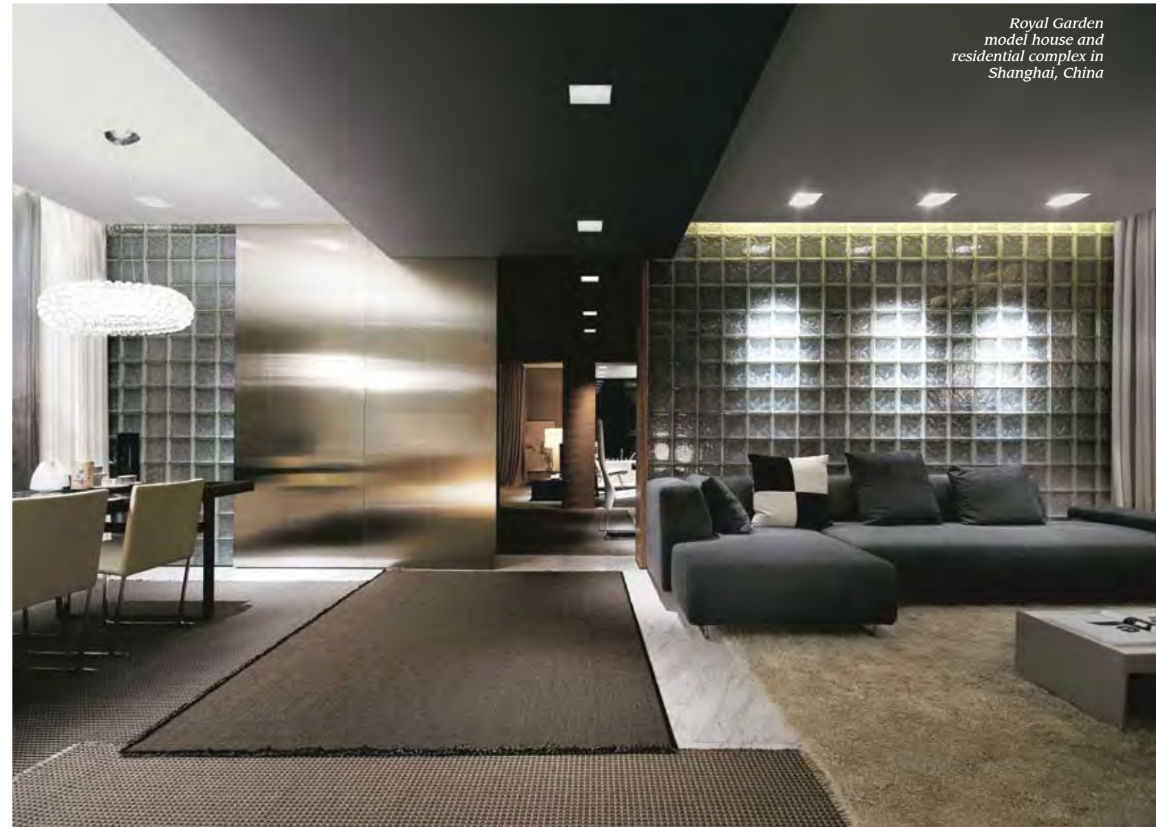
Royal Garden model house and residential complex in Shanghai, China

Lipparini's touch can be found across the globe, including in countries like China, where his involvement with the Royal Garden project represents a significant step forward in the designer's