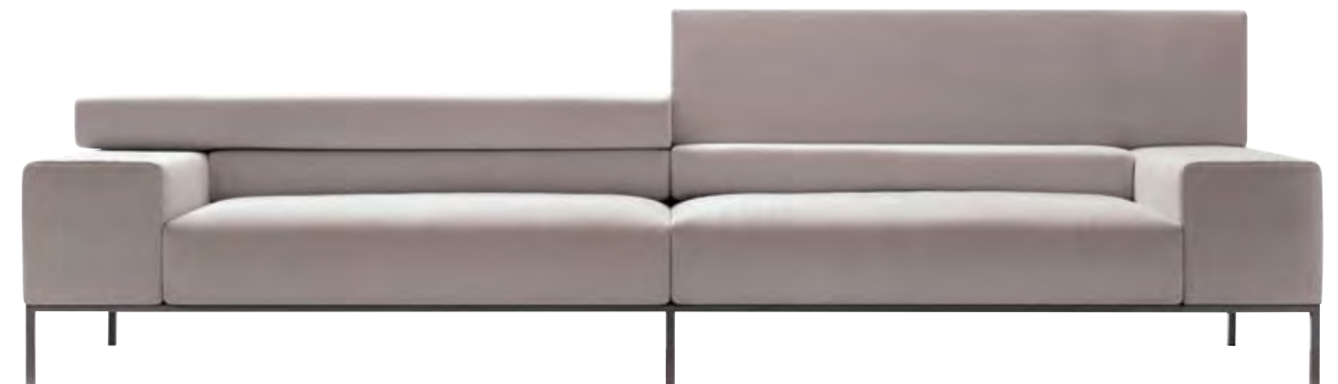
Solid Up sofa for Seven Salotti (Italy)