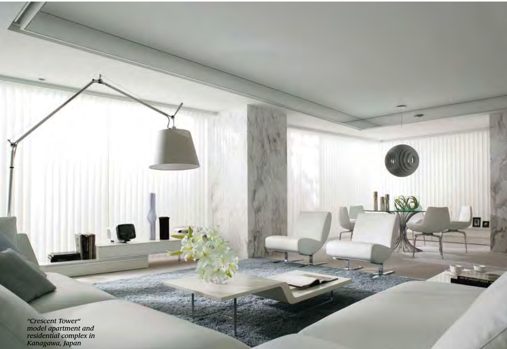
“Crescent Tower” model apartment and residential complex in Kanagawa, Japan